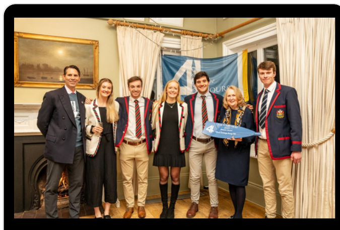
Davison award winners! November 2025